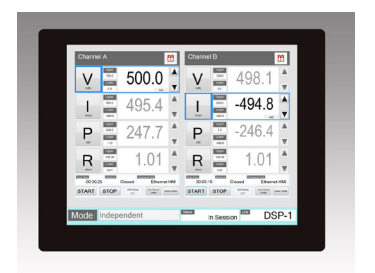
Touchscreen HMI for local control & easy identification of operating state.